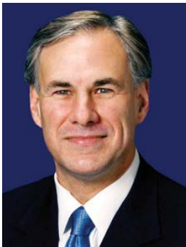
TEXAS ATTORNEY GENERAL GREG ABBOTT

As part of the sweep, Attorney General Cooper announced actions he had taken against 19 companies, including Possibilities Unlimited, a company that made illegal robocalls to pitch lower credit card rates in exchange for a fee. Attorney General Cooper obtained a court order banning the company from making any calls to consumers in his state, and requiring it to pay more than $500,000 in fines.