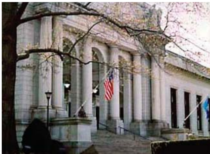
Connecticut State Supreme Court

The Republican Party appealed the court's ruling. The Connecticut Supreme Court issued a single-page ruling, holding that Bysiewicz's was not qualified to serve as Attorney General of Connecticut. The court is expected to issue a detailed ruling soon.