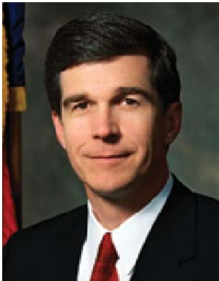
ROY C. COOPER