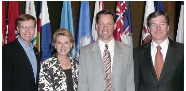
NAAG Leadership with Washington Governor Christine Gregoire.

The Association elections were just one part of the NAAG Summer Meeting held in Seattle. The theme was “Using Technology to Protect the Public” with program sessions dedicated to that topic. Meeting highlights included Washington Governor and former Attorney General Christine Gregoire who spoke about access to justice and providing legal services using technology. An afternoon spent at the Microsoft campus had panels discussing how to protect online identification and fighting pirated and counterfeit products.