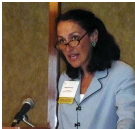
FDA Commissioner Margaret Hamburg, MD, gave the Sorrell Lecture on Tobacco.

Any use and/or copies of the publication in whole or part must include the customary bibliographic citation. NAAG retains copyright and all other intellectual property rights in the material presented in the publications.