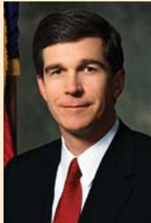
NORTH CAROLINA Roy Cooper President-Elect