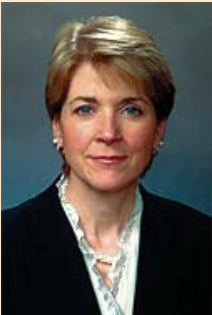
MASSACHUSETTS Martha Coakley Presidential Appointment