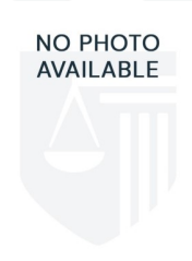
TOM MELTON Utah