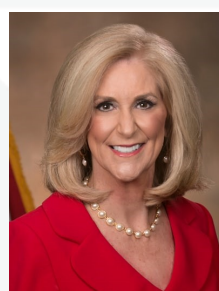
LYNN FITCH Mississippi Attorney General