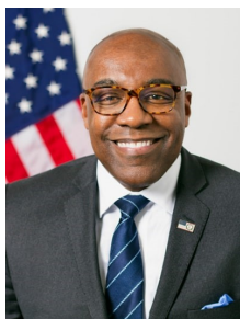
KWAME RAOUL Illinois Attorney General