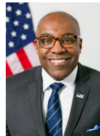
KWAME RAOUL Illinois