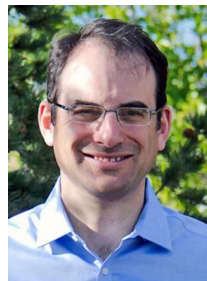
PHIL WEISER Colorado