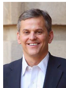
JOSH STEIN North Carolina